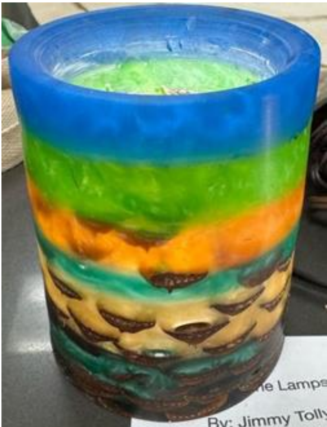
the Lampe By: Jimmy Tolly