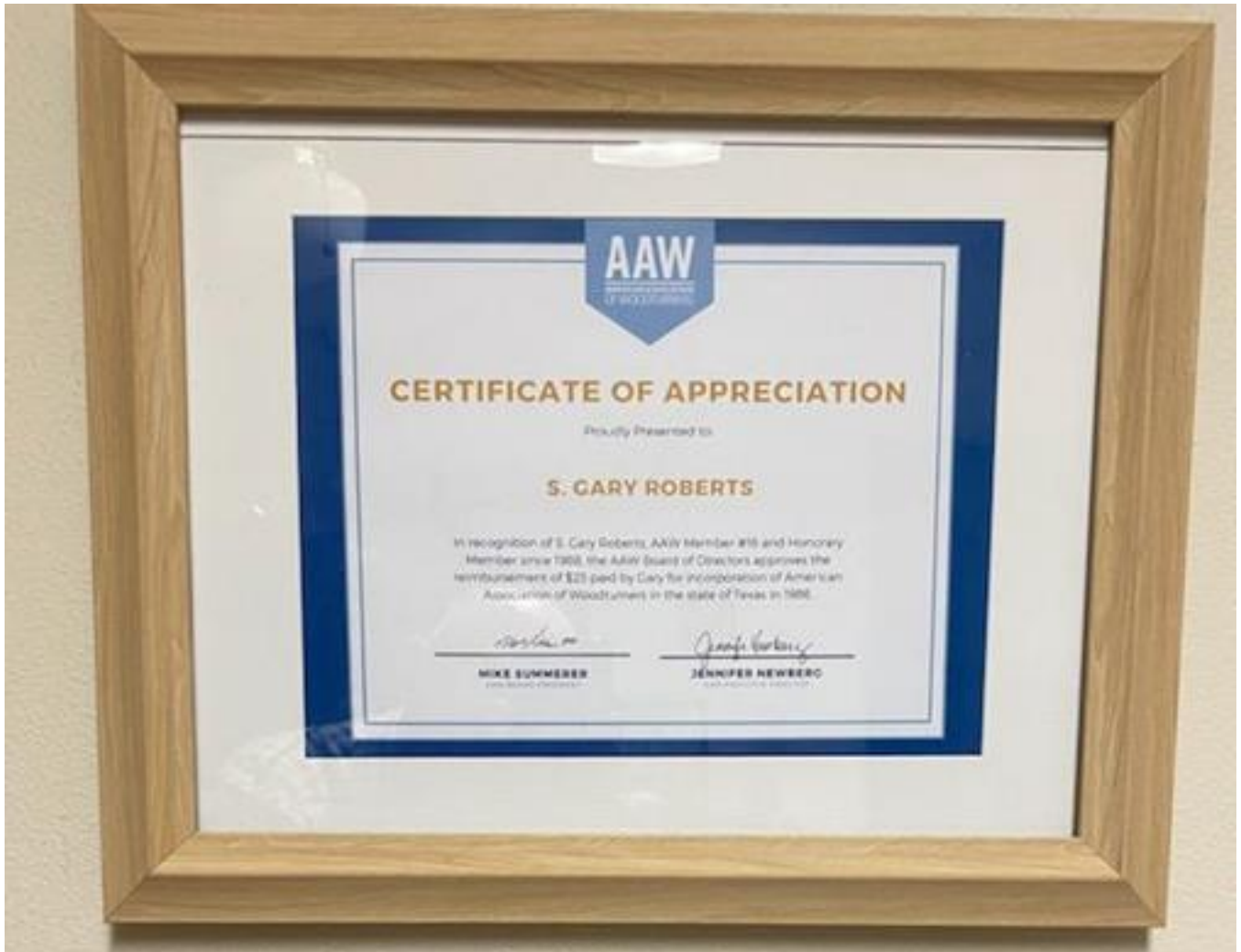
Gary had to cash the check before the framer would frame it!