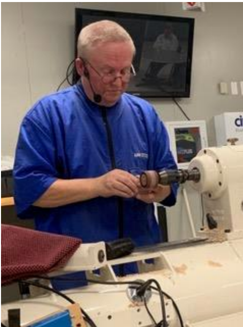
Sanding completed femisphere