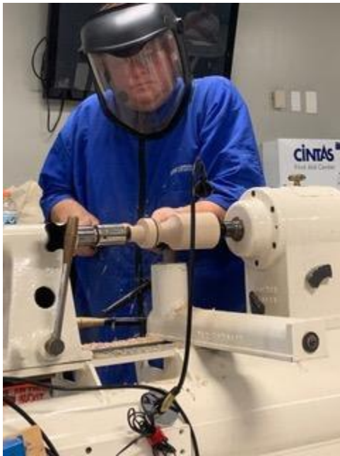
Turning 1 st half of femisphere