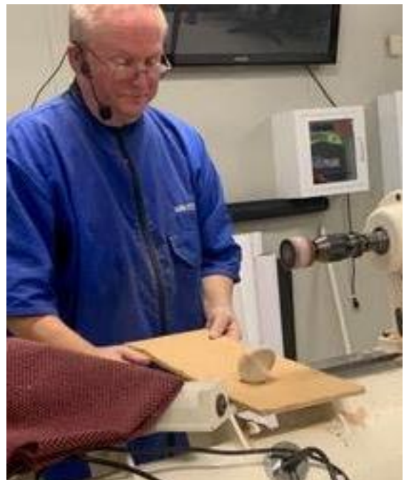
Demonstrating the femisphere rolls in a straight line while appearing to wobble