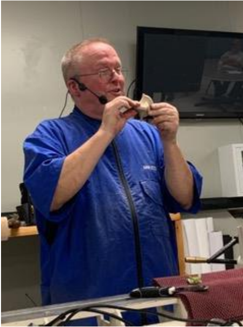
How to put 2 halves back together