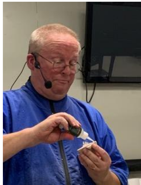
Gluing 2 halves back together