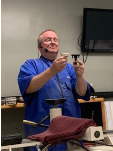
Headstock drive center and Shop made tailstock center