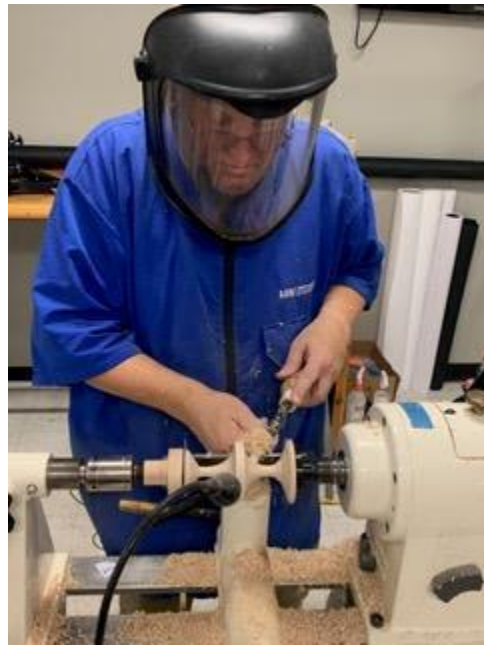
Turning 2 nd half of femisphere