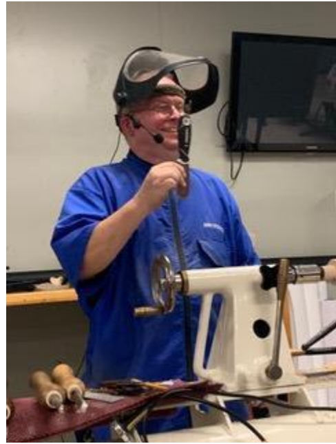
Modified paint scraper tool to separate 2 halves of femisphere