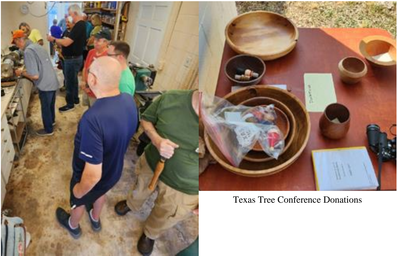
Texas Tree Conference Donations