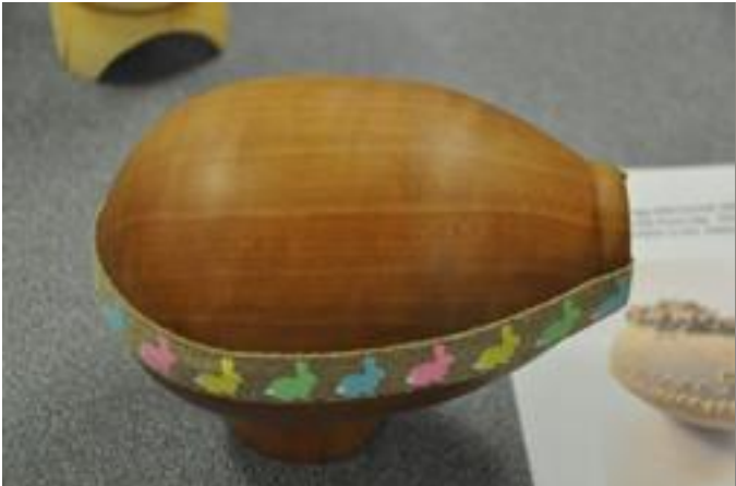
Panoramic Easter egg with turned rabbit in bradford pear by Beth Watkins. Other items inside are made from clay. This egg is inspired by the panoramic sugar egg made by Beth's mother in the 1960s shown in the photos below.