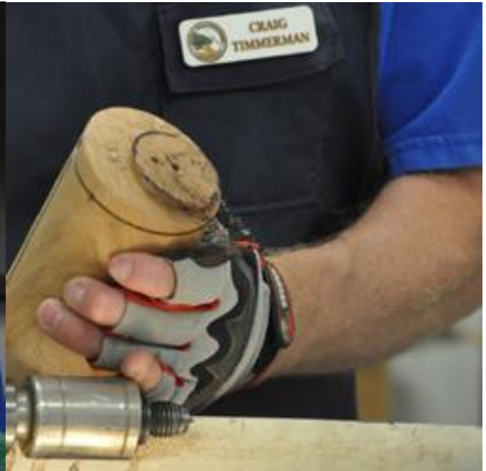
Preparing for offset version