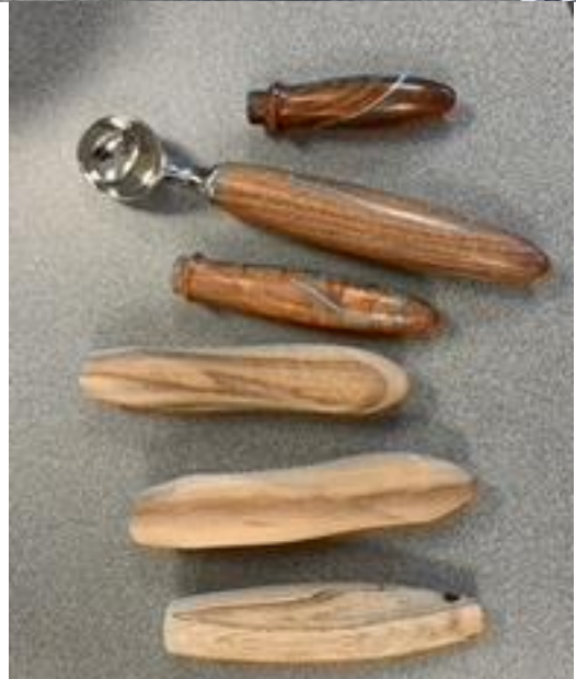
Example Kitchen Utensil Handles