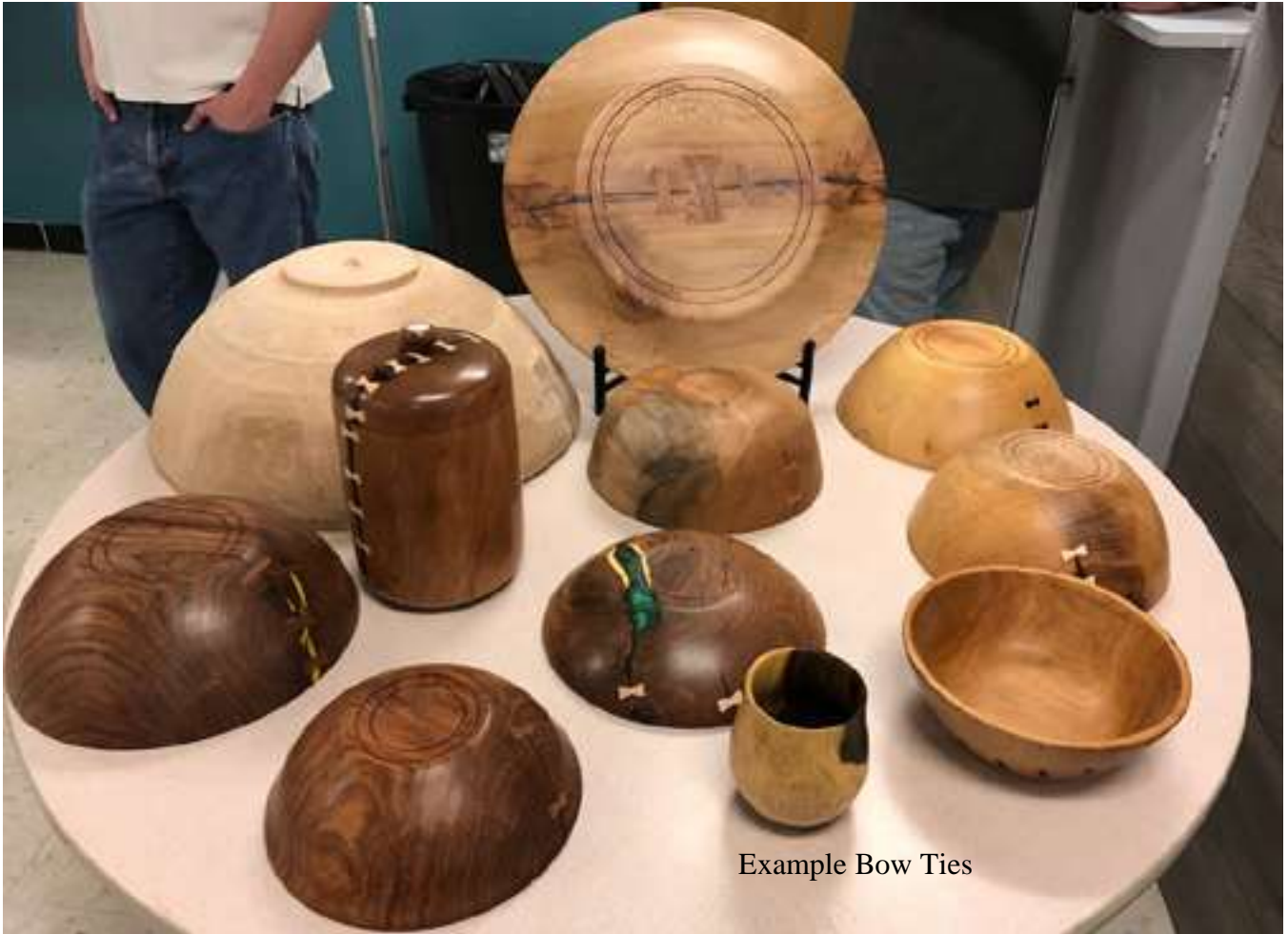
Example Bow Ties