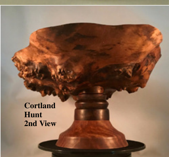
Cortland Hunt 2nd View