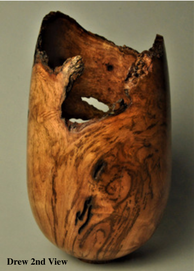
Drew 2nd View