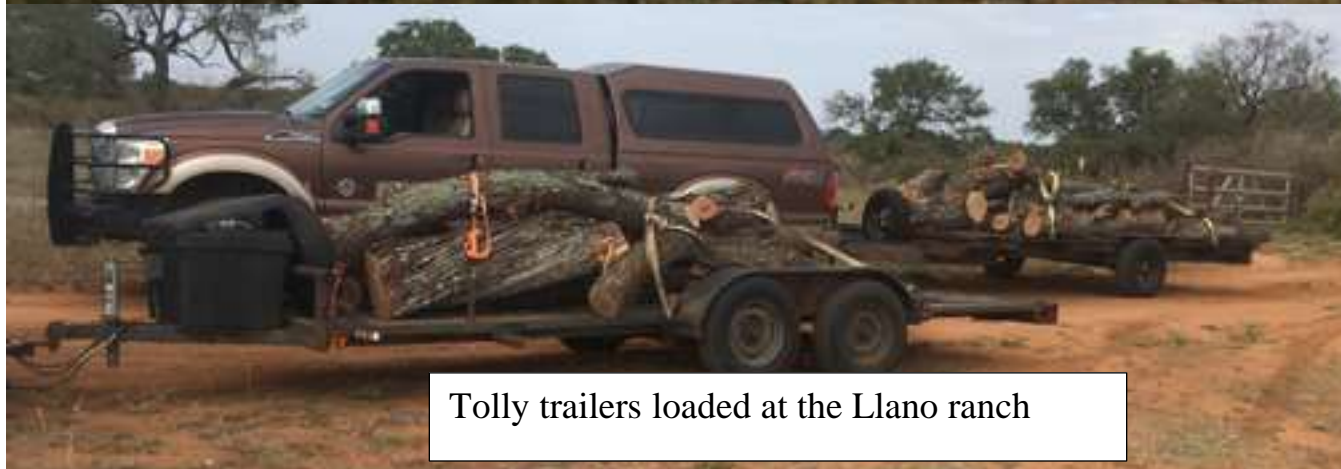
Tolly trailers loaded at the Llano ranch