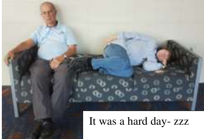
It was a hard day- zzz