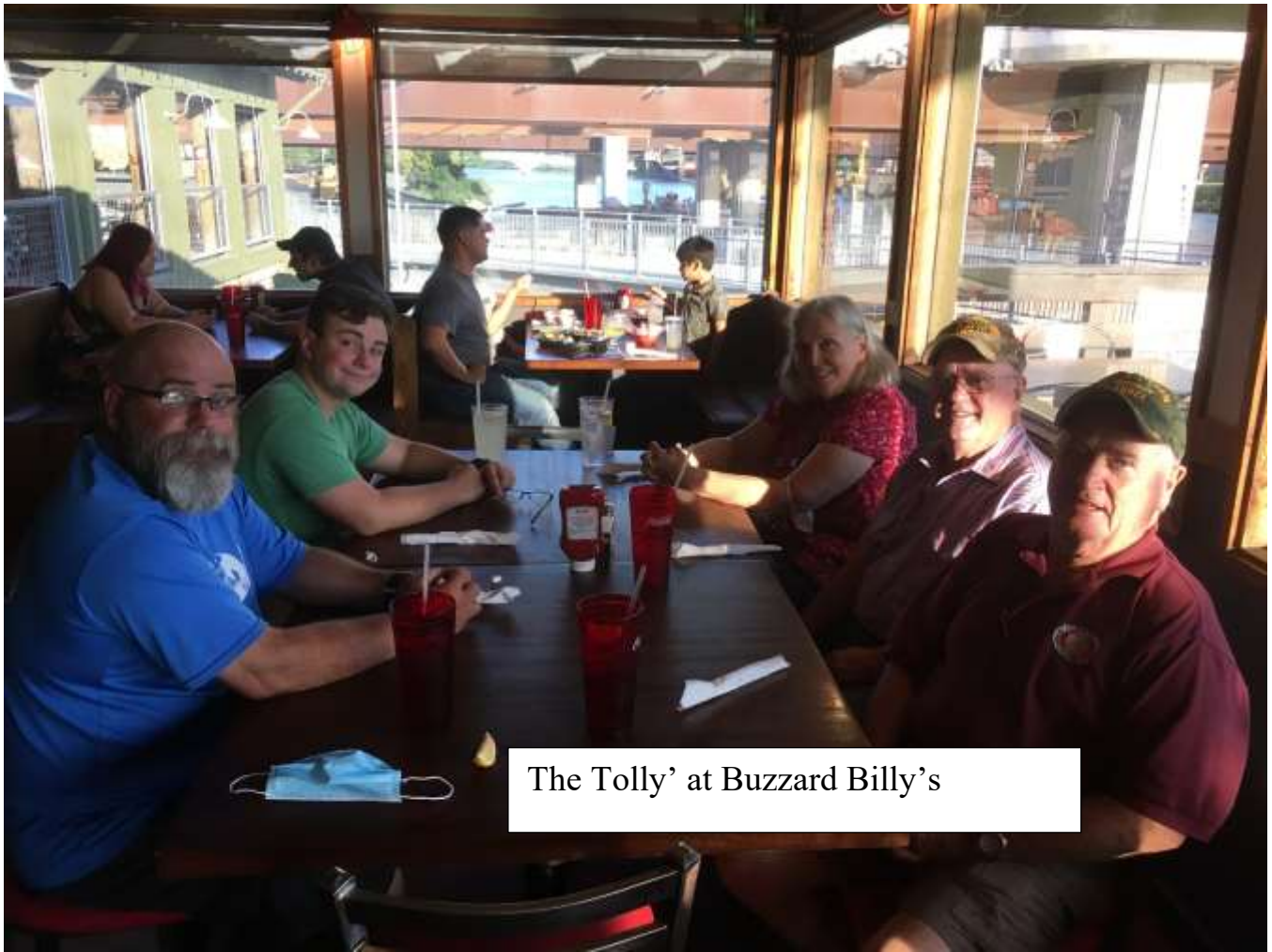
The Tolly' at Buzzard Billy's