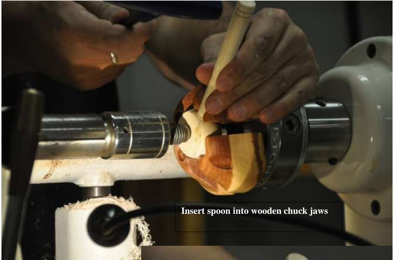
Insert spoon into wooden chuck jaws