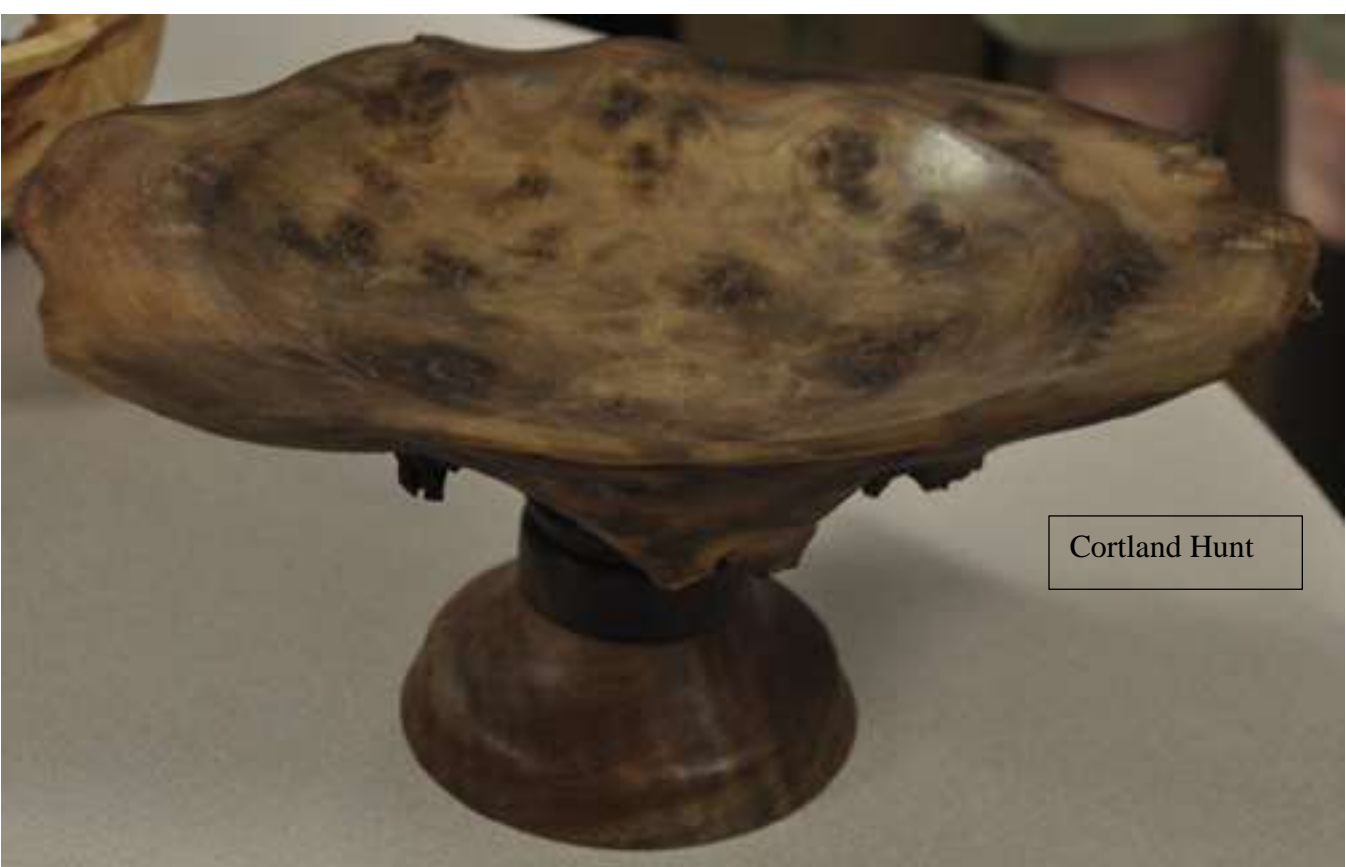
The Chip Pile – Central Texas Woodtruners Association Page 3