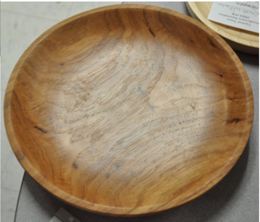
The Chip Pile - Central Texas Woodturners Association - September 2019 Page 9