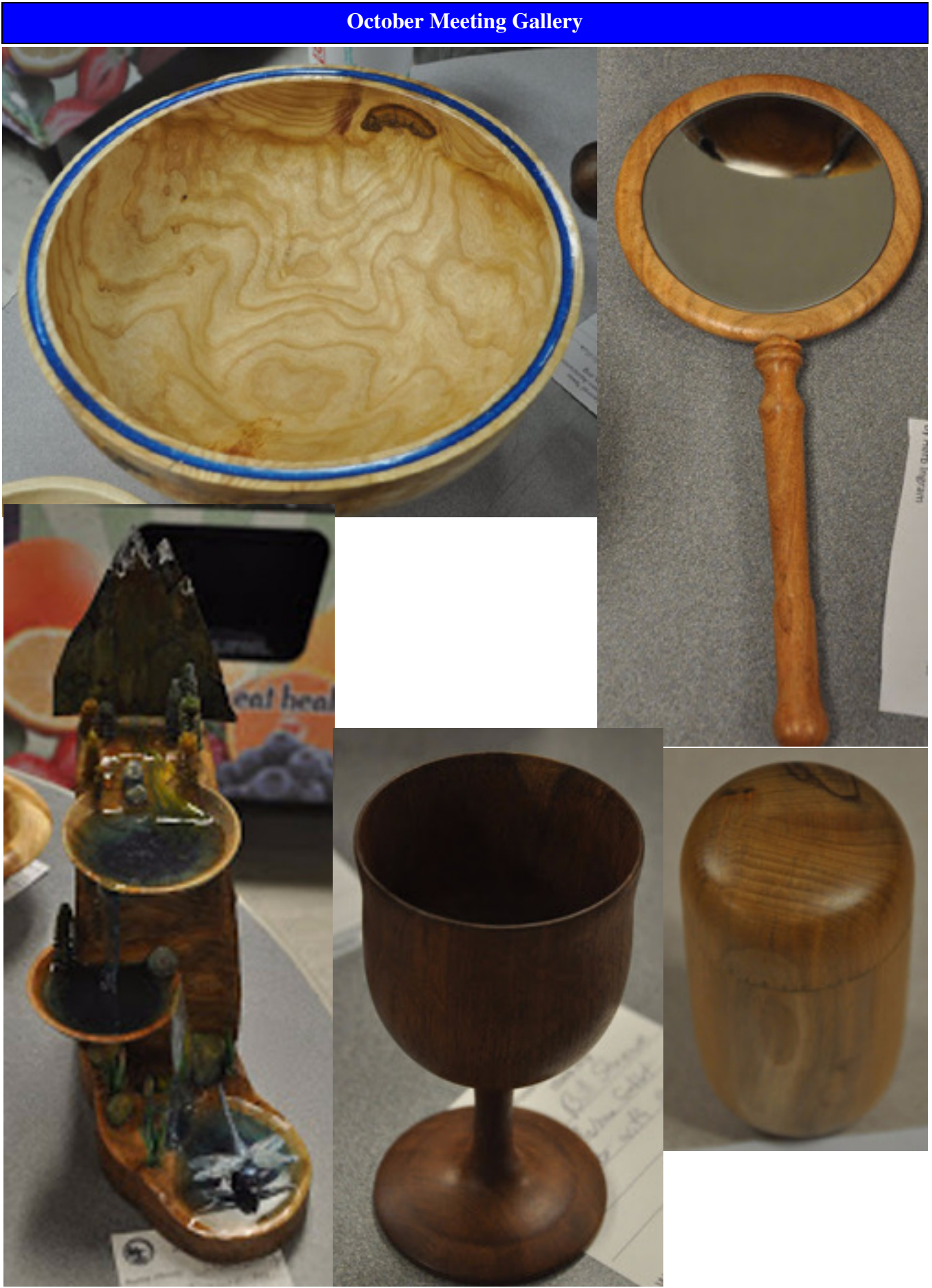
The Chip Pile - Central Texas Woodturners Association - September 2019 Page 6