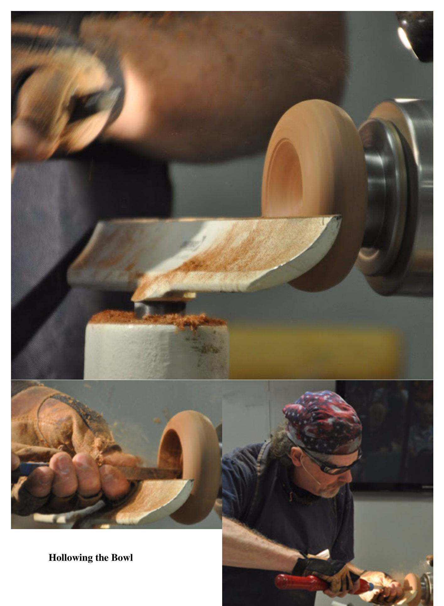
The Chip Pile - Central Texas Woodturners Association - October 2019 Page 21