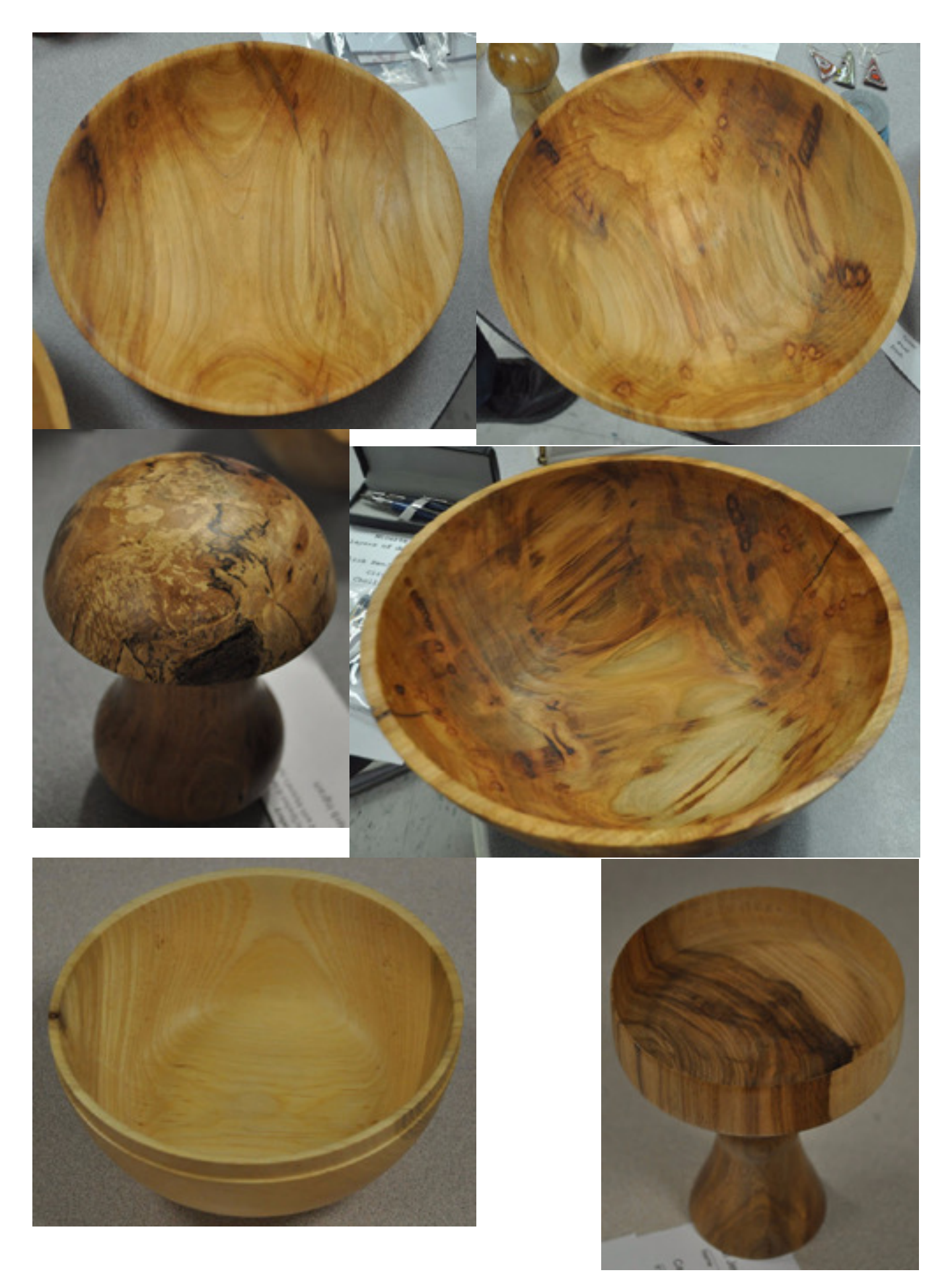
The Chip Pile - Central Texas Woodturners Association - September 2019 Page 8