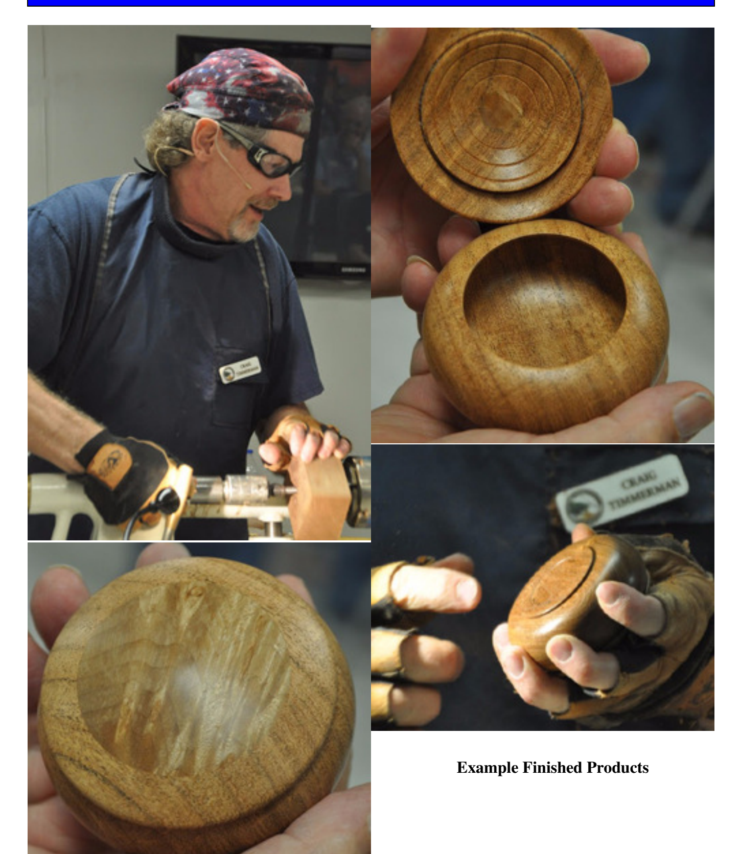
Lid with Insert