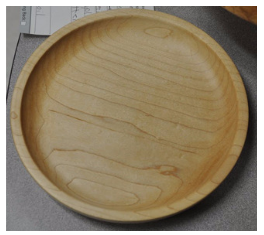
Click Pens Cholla Cactus