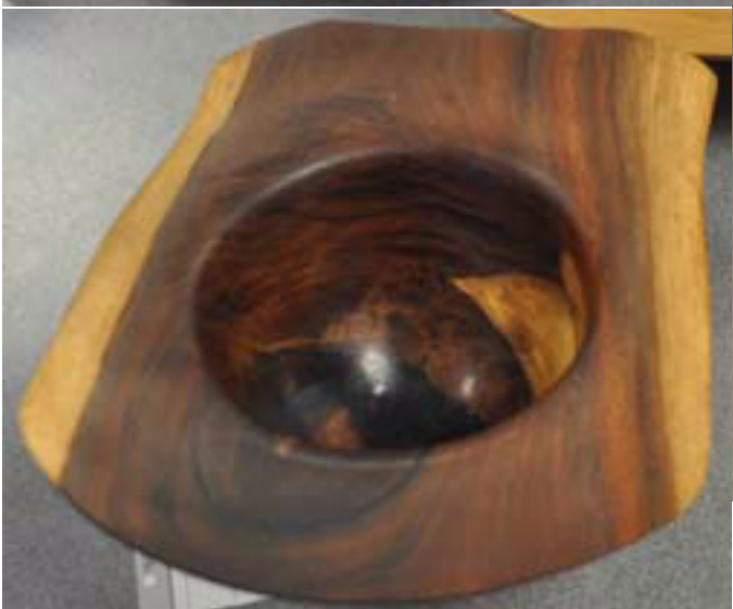
Small Bowl & Depth Gage