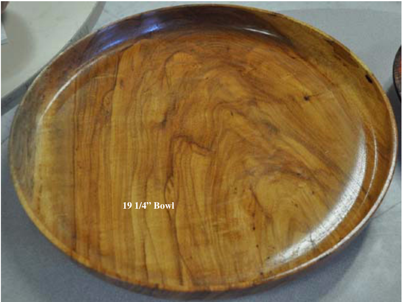
19 1/4" Bowl