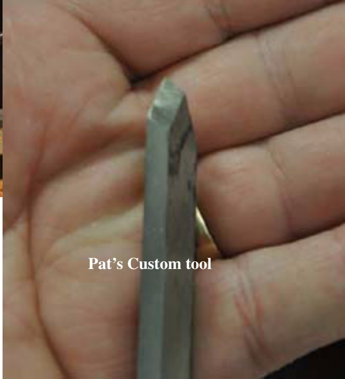
Pat's Custom tool