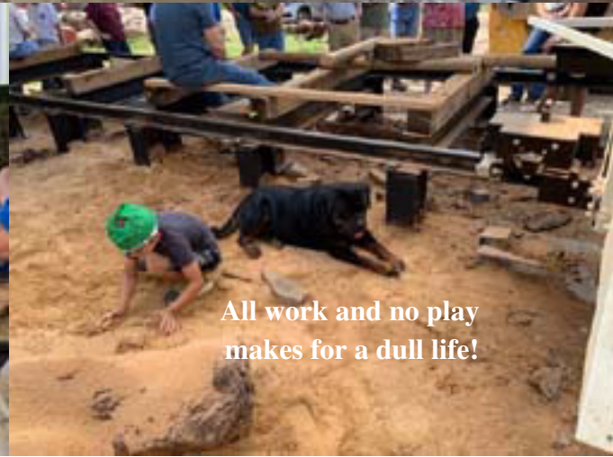
All work and no play makes for a dull life!