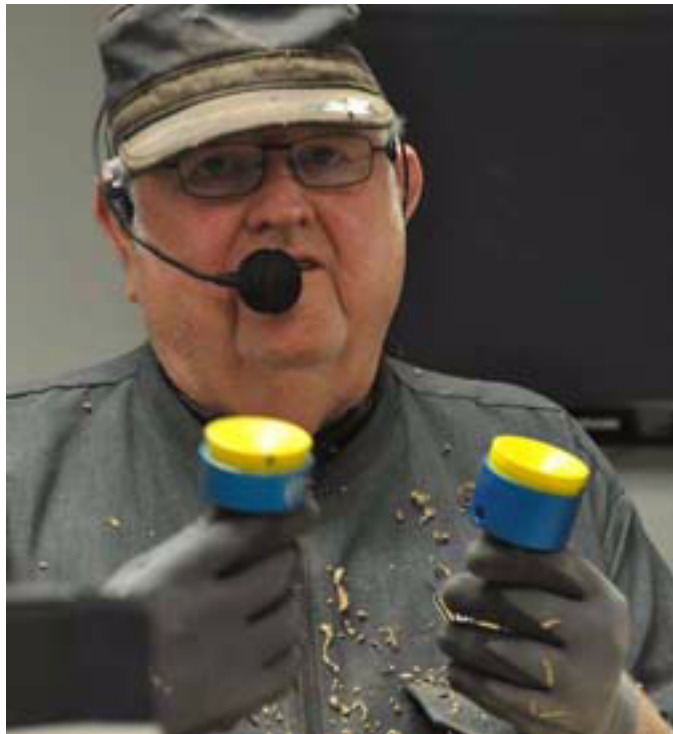
Special centers to mount rounded portion of sphere