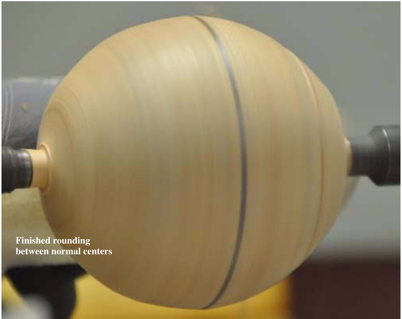
Finished rounding between normal centers