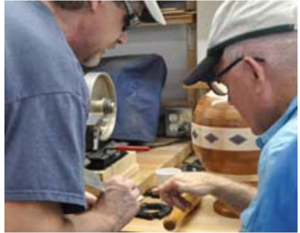
The Devil is in the Details