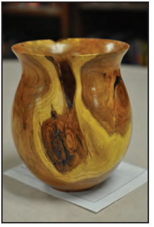
Dwight Schaeper: Len Brissett