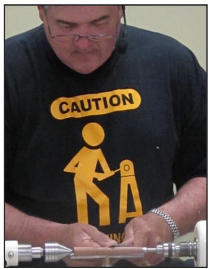
out comes his skew, sweet and easy, Those who haven't seen him turn before in the front row try to ignore his t-shirt, and

Out of the cigar wood sure enough is shaping Don turns a beautiful curve to this pen; talking about all the different kinds of shapes to choose from.