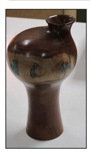
These are mesquite-filled Turquoise. Finally he had a natural edge mesquite bowl MM