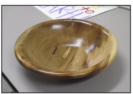
(dust mask) finished with wipe on poly.