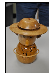
Mack Peterson created South Texas Snowman out of Pear and Walnut.