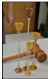
Joe Kirk's hackberry Easy wood mini tool was envied by more than one woodturner!