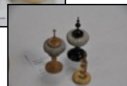
White turned Bubinga and Abrosia Maple bowls and finished with tung oil.