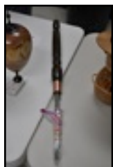
Always original, Mack Peterson created a Texas 42 Domino Bowl out of Paduck, Yellowheart and Walnut. This deck took more than 42, try 514 pieces!