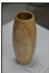
Mesquite is known for its magical quality in turning. Ed Roberts captured it perfectly in this Vase/ Container using wipe on poly.