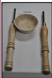
Mac Petruso brought black palm and EZ rough scraper.