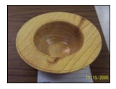
Stacey Hager brought two pieces, a candle holder turned from cherry and