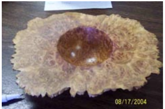
Red mallee bowl

burl bowl finished with oil and a large cherry platter finished with velvet oil.