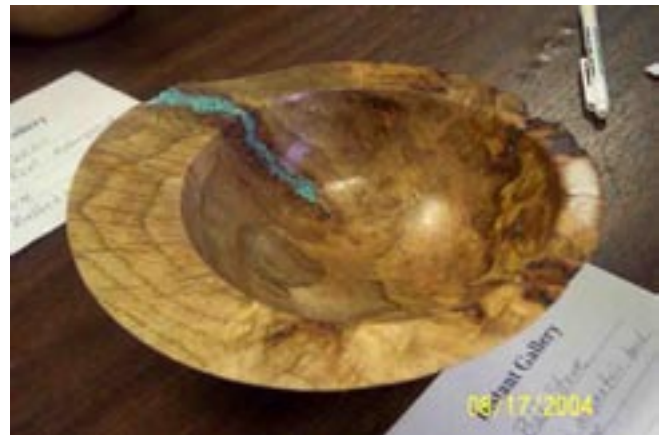
Bill's bowl