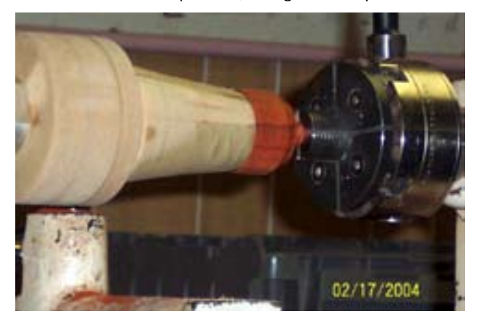
Turning the bell

If the friction drive slips a bit, he tightens it up with a little