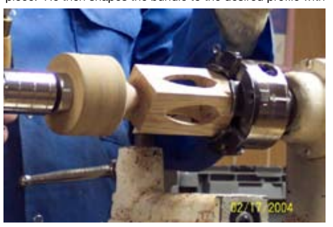
Turning the inside

chucks this taped-up blank in the Stronghold chuck, then uses the point of the live center to align the center of the four squares before tightening the Stronghold. (Take care with the live center, you are just using it for alignment, and you don't want to separate your squares.) When the piece is aligned and tightened in the chuck, the point is removed from the live center and the cup center used to support the piece. He then shapes the bundle to the desired profile with