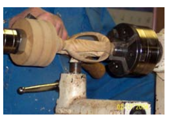
Turning the outside

The bundle is then removed from the chuck. The tape is cut, the pieces are reversed (so that the turned part is now on the inside) and then glued together. A 5/16" hole is drilled in the center of each end. A shopmade MDF tailstock with a 5/16" is used to center the piece before the chuck is tightened and to support it while the outside turning is completed. (Go to www.turningwood.com for Johnny's instructions for making MDF chucks.)